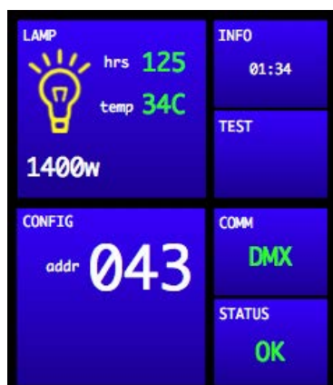
Sample Menu Screen

Bad Boy features a built-in LCD touchscreen display, which provides access to control, configuration, status, and testing functions.